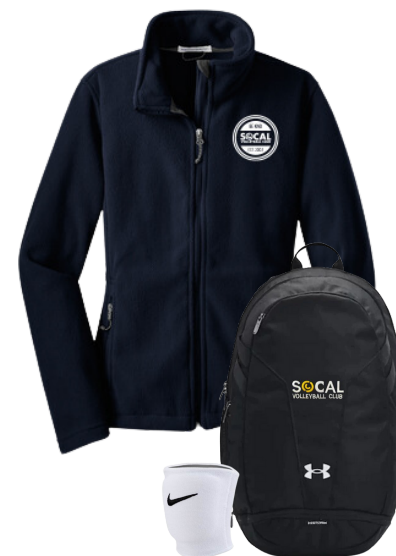
Tournament Weekend Essentials Fleece Jacket in Navy $54 Nike Dri-FIT Knee Pads $27 Under Armour Hustle 5.0 Backpack $70