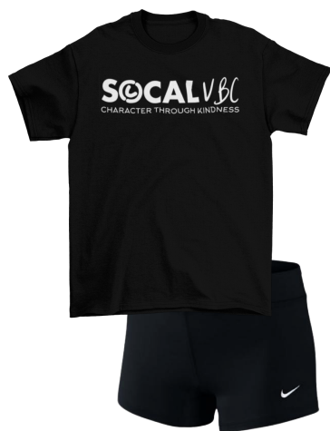
Practice Backups Extra Practice Shirt $23 Nike Performance Spandex Shorts $35

Grab any of the following items during registration or at store.socalvbc.com Prices are subject to change. Items listed here include tax.