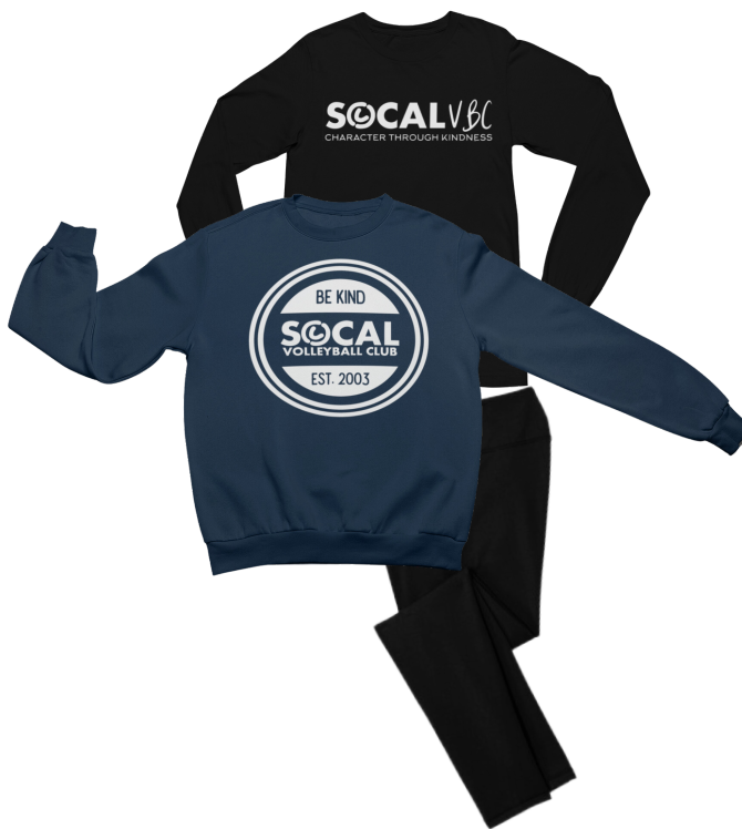
"I'm Always Cold" Gear Long Sleeve Practice Shirt $32 Crew Neck Sweatshirt in Navy $38 Spandex-Style Volleyball Leggings $35