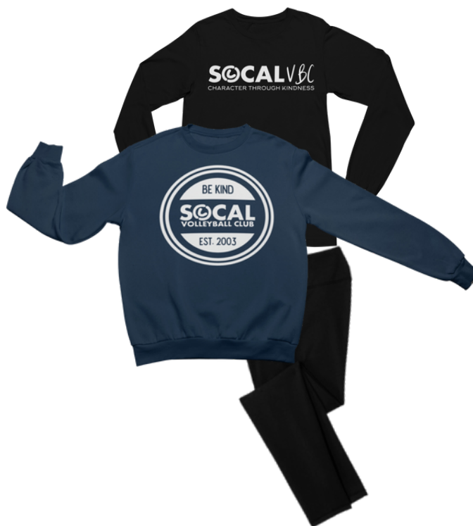
"I'm Always Cold" Gear Long Sleeve Practice Shirt $32 Crew Neck Sweatshirt in Navy $38 Spandex-Style Volleyball Leggings $35